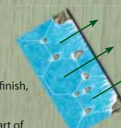
Finish: leave the game board!