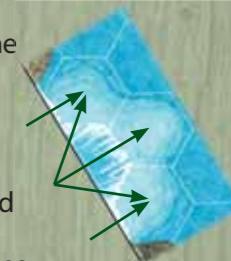
Possible first spaces at the beginning.